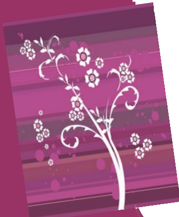
The Pennsylvania State University Phi Sigma Rho-Lambda Chapter