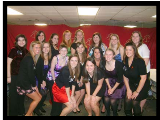
University of Dayton, Gamma Chapter Recruitment