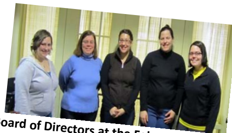
The Board of Directors at the February 2011 Face to Face Meeting in Columbus, OH.

The Board would like to thank all those who have and continue to volunteer with the Foundation. We can't do it without you!